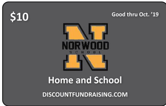
CMYK LAMINATION 3.375" x 2.125"

Please include either cash or a check made out to Norwood Home & School with you order.