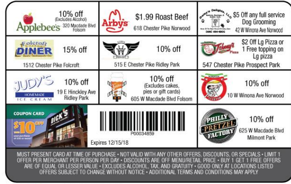
CMYK LAMINATION 3.375" x 2.125"